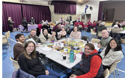
Second Place Getters

Parish Assembly. Thank you to those who attended and made the event successful. Special thanks to the Leadership Team for their input and time taken to organise and plan this special event.