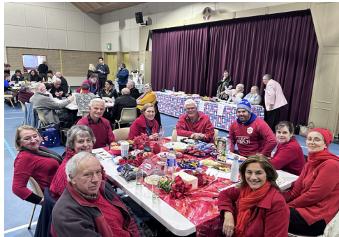
The Best Dressed Table